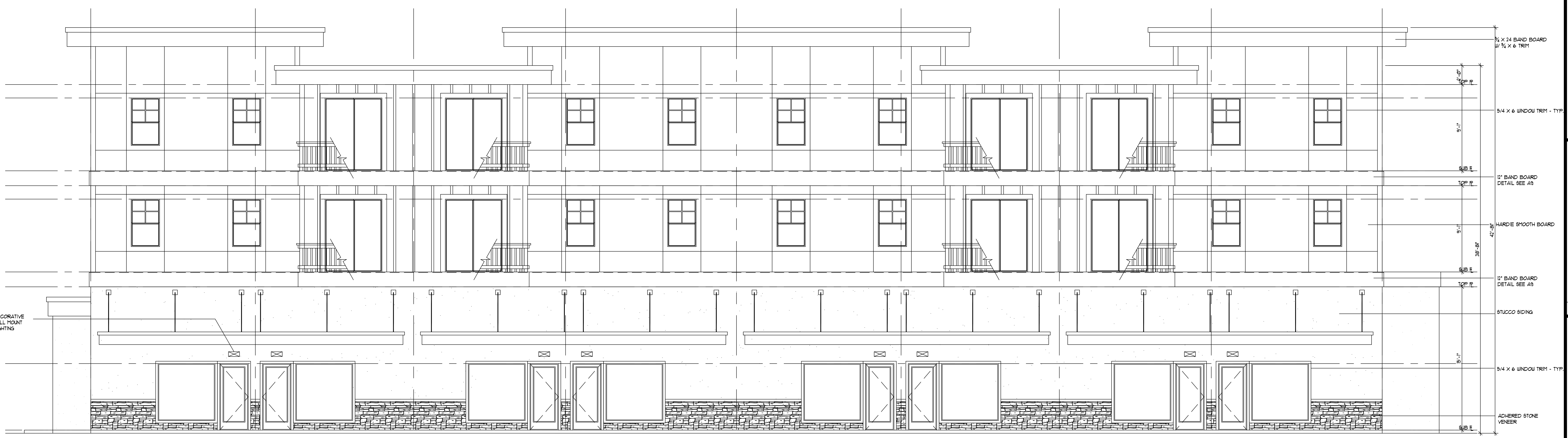
WEST ELEVATION (ANN ST)

THESE CONSTRUCTION DOCUMENTS ARE FOR THE CONSTRUCTION OF RENTAL APARTMENTS AND ARE NOT TO BE CONDOLINIZED